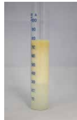
Poor separability Reduces fluid life

Test: 80% aqueous cutting fluid at 10% concentration in 20*dH water with 20% slideway oil after 15mins at 30°C. Test measures speed and degree of separation.