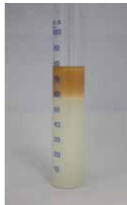
Good separability Easy to remove